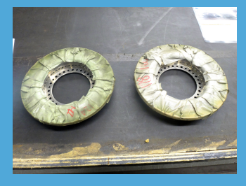
After spraying: DeWAL Plasma X tape on front/back of part