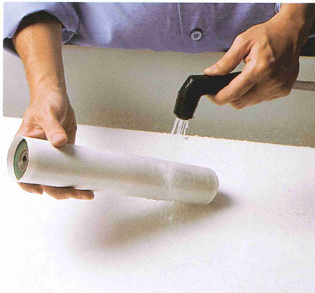
When the sleeve is flushed with water, it shrinks tightly to the roller in approximately 3 minutes.