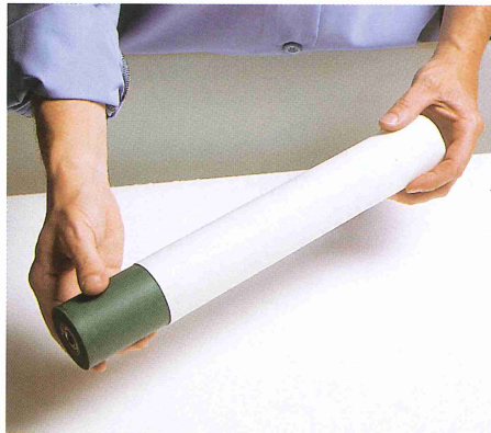
Instead of tying or sewing, you simply slide a Rogers Dampening Sleeve over your roller.

The nonwoven fibers in a Rogers Dampening Sleeve won't trap greasy ink.